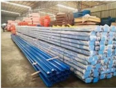
Package for Upright Frame