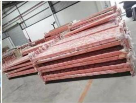
Package for Beam