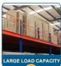
LARGE LOAD CAPACITY