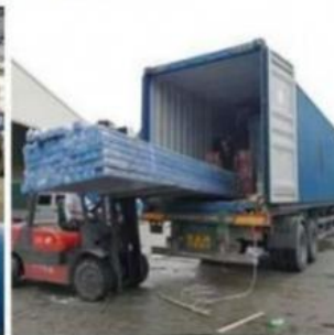
Loading for Wire Mesh Cage